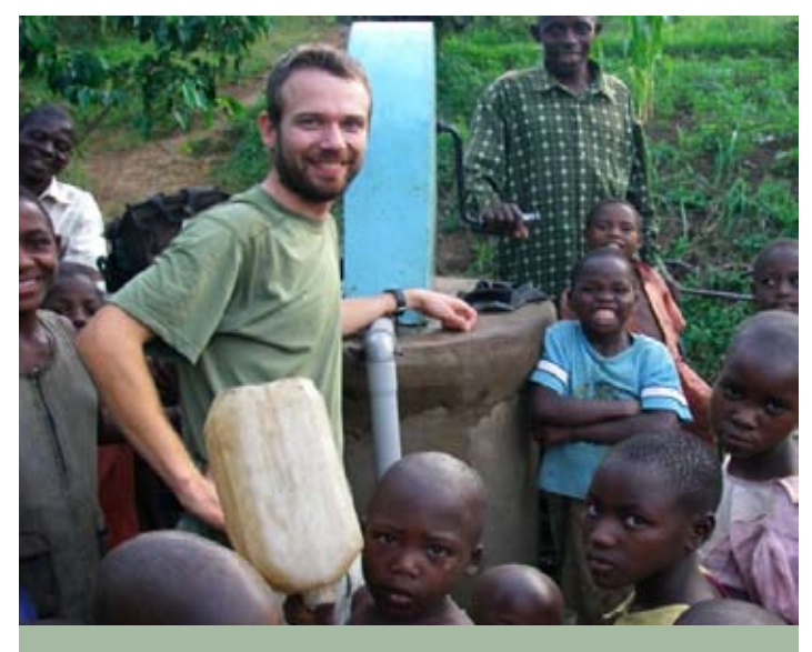
Children waiting to gather water from the new, clean source. Jonathan stands nearby.

and contaminated source was nearby, almost everyone patiently waited for me to finish because they told me that nobody liked the 'old' water anymore. They all wanted clean water from the new source!"