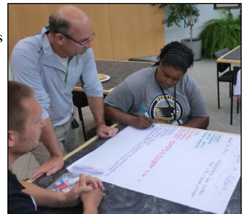
Taking it back to the classroom.

Teachers may apply for Michigan Space Grant Consortium K-12 Educator Incentive Program funds for up to $400 to attend workshops on math and science. To apply: http://mi.spacegrant.org