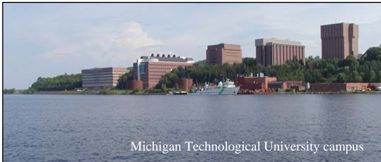
Michigan Technological University campus

The credits earned from this institute can be applied to a planned course of study for teachers working towards their Professional Certificate or a Master of Science in Applied Science Education at Michigan Tech.