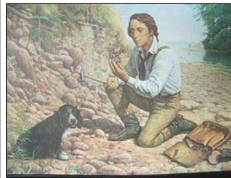
The United States Postal Service will honor Douglass Houghton's contribution to geology and the copper-mining industry from 11 a.m. to 3 p.m. Saturday at Michigan Technological University's Douglass Houghton Hall with the presentation of a pictorial postmark made from a painting of Houghton.